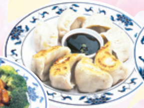
STEAMED OR FRIED RAVIOLI