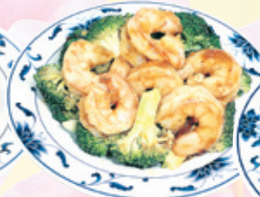
JUMBO SHRIMP W. BROCCOLI