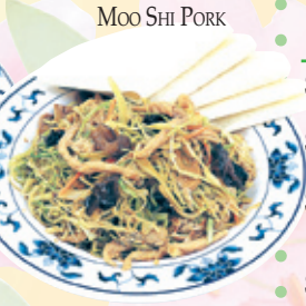
MOO SHI PORK