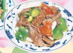
PEPPER STEAK W. ONION