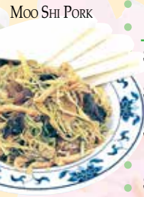
MOO SHI PORK