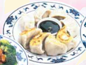
STEAMED OR FRIED RAVIOLI