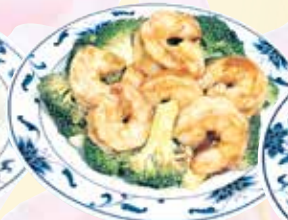
JUMBO SHRIMP W. BROCCOLI